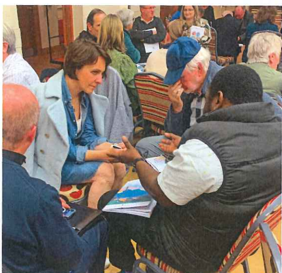
Discussions under way at a recent Building Hope workshop at St Mochta's Parish Pastoral Centre, Porterstown