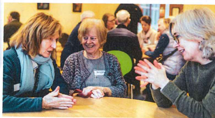
Parish partnerships across the Archdiocese are holding their own meetings, such as this one for the Ringsend, Sandymount and Haddington Road Partnership at the Avila Retreat Centre in March

YOUR WEEKLY SUPPORT FOR SHARE HELPS TO SUSTAIN THE LIFE AND MISSION OF THE CHURCH HERE IN THE ARCHDIOCESE OF DUBLIN